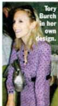
Tory Burch in her own design.